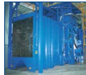
Extended length vestibules