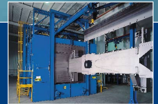
Monorail Machine includes a roof slot for overhead conveying system, extended vestibules for improved abrasive retention and lighted blow-off enclosure