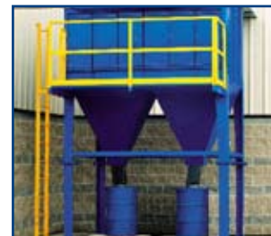
Cartridge filter dust collector

Subject to technical alterations • 207 • © www.wheelabratorgroup.com