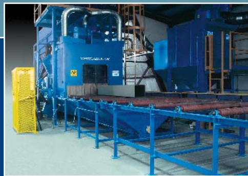
Preblast Plate and Structural Machine cleans plate and structural shapes prior to fabrication, includes an abrasive removal blow-off, spill hopper and external roll conveyors.