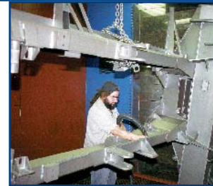
Lighted enclosure for abrasive removal and airblast touch up

Test machines in LaGrange, Georgia are used for customer demonstrations as well as for developing new designs and confirming blast wheel locations and horsepower requirements.