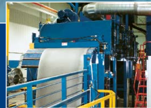
Steel strip descaling systems