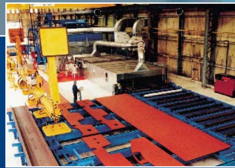
Plate and structural steel preservation line with automated blast and paint equipment