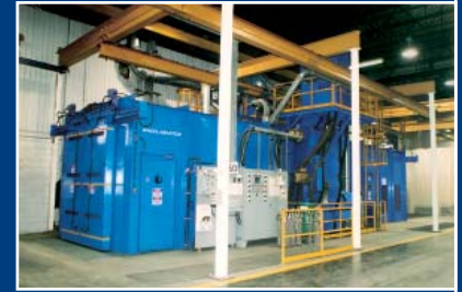
Sliding doors seal containment booth