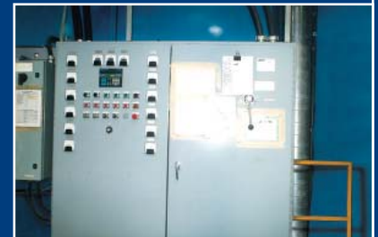
Work piece recipe selection

Subject to technical alterations • 2/07 • © www.wheelabratorgroup.com