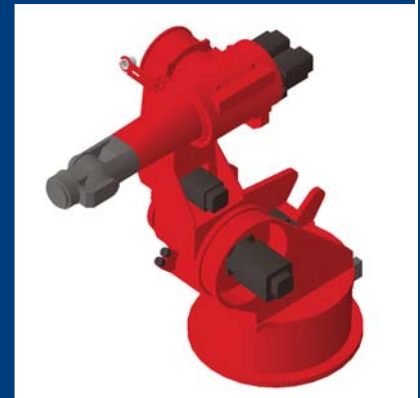
Programmable Robot Gripper