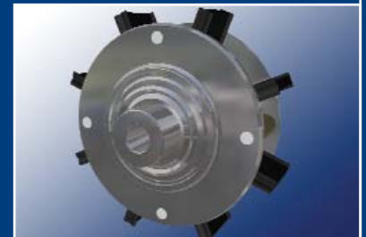
Blast Wheel and Blades