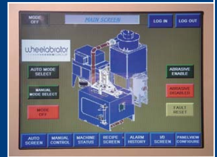
User-friendly operator interface