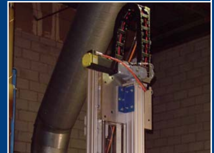
Multi-axis nozzle manipulator