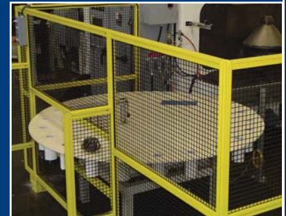
Table to accept peened parts