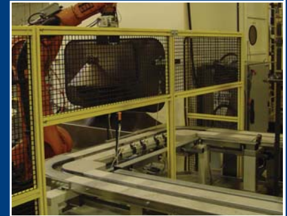
Infeed Conveyor presents parts to robot