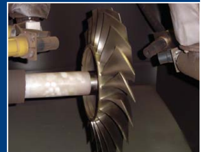
Part on mandrel for coverage and media drainage