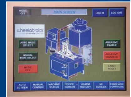
User-friendly operator interface